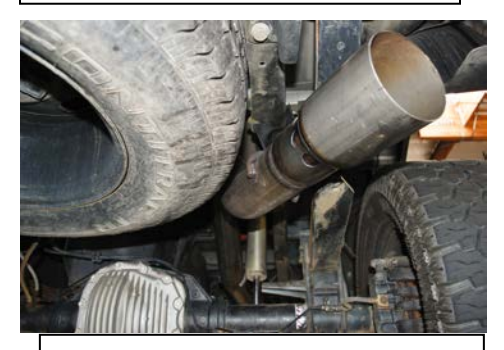
5. Install the exit pipe Item #C Be sure there is clearance from the spare tire and shock. You may need to adjust the pipes for a proper 1.50" of clearance.