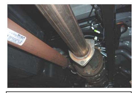
2. Be sure to not damage the gasket and bolts they will be re used for the exhaust install.

1. Disconnect the negative battery cable before removal of the OEM Exhaust. This will allow the computer to reset and recognize the new exhaust. Lay out the exhaust on the floor so it looks like the drawing and compare parts with manual. Remove the factory exhaust by cutting behind the factory muffler. Once the tail pipe has been removed un-bolt the muffler and head pipe at the flange located in front of the factory muffler. Use wd-40 or another type of penetrating oil to remove the rubber grommets. Do not damage these they will be re used.