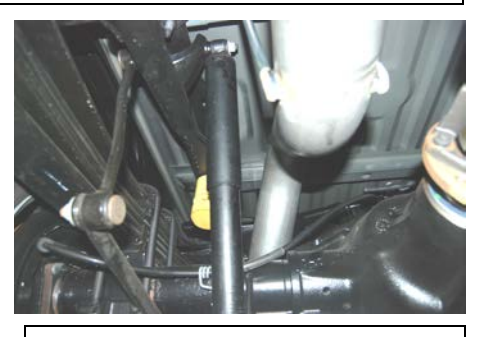
4. Install Over axle pipe Item # B onto the head pipe. Use clamp Item E to secure but do not tighten.