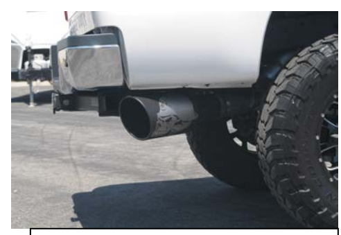
7. With proper clearance from spare tire and the tip in your desired position begin to tighten down all clamp connections from the front head pipe back to the tip.