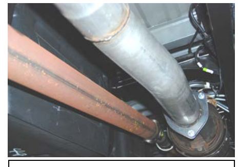
3. Install Head pipe Item #A onto the factory flange. Do not tighten until install is complete.