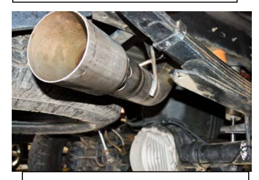
6. Install The Exhaust tip. The kit was designed to have a 1" clearance from the bottom of the quarter panel.