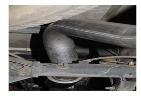
6. With proper clearance from spare tire, install the exhaust tip onto the tailpipe. The system was designed to have the tip 1" below the quarter panel of the vehicle. With the tip in your desired position begin to tighten down all clamp connections from the front head pipe back.