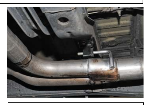
4. Install the Resonator Item #B onto the head pipe Item # A. The inlet of the resonator will have the louvers opening towards the front of the vehicle. Install extension pipe Item # J onto the resonator. Loosely tighten down.