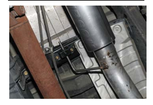
5. Install The muffler assembly Item # C Onto the resonator. Also slide the muffler hanger into the factory rubber grommet. Install the over axle pipe Item # D into the muffler outlet and install the hanger into the rubber grommets. Use clamp Item # F to secure. Do not tighten