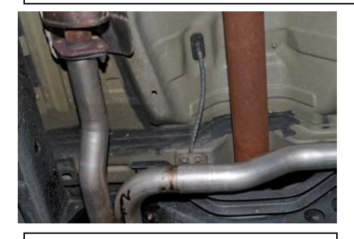
2. Install Head pipe Item # A onto the factory flange. Install hanger into rubber grommet and loosely tighten down the flange.

1. Disconnect the negative battery cable before removal of the OEM Exhaust. This will allow the computer to reset and recognize the new exhaust. Lay out the exhaust on the floor so it looks like the drawing and compare parts with manual. Remove the factory exhaust by cutting behind the factory muffler. Once the tail pipe has been removed un-bolt the muffler and head pipe at the flanges located behind the catalytic converters. Use wd-40 or another type of penetrating oil to remove the rubber grommets. Do not damage these they will be re used.