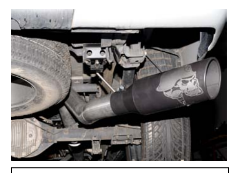
7. Be sure to check all clearance after each section has been tightened to be sure there is proper clearance. It may take 4-500 miles for your vehicle to fully adjust to the changes in exhaust flow.

"MAKE SURE YOU HAVE A 1" CLEARANCE ON ALL PIPES FROM ALL RUBBER BRAKE LINES, SHOCK BOOTS, TIRES, ETC..." TORQUE ALL CLAMPS TO APPROX. 100 TO 150 FT LBS.