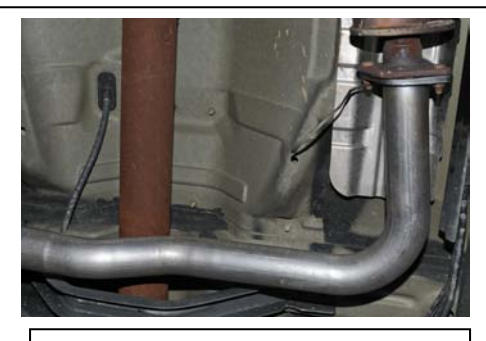
3. Install Head pipe Item # H onto the factory flange. Slide the head pipe into item # A before attaching the two bolts. Loosely tighten down.