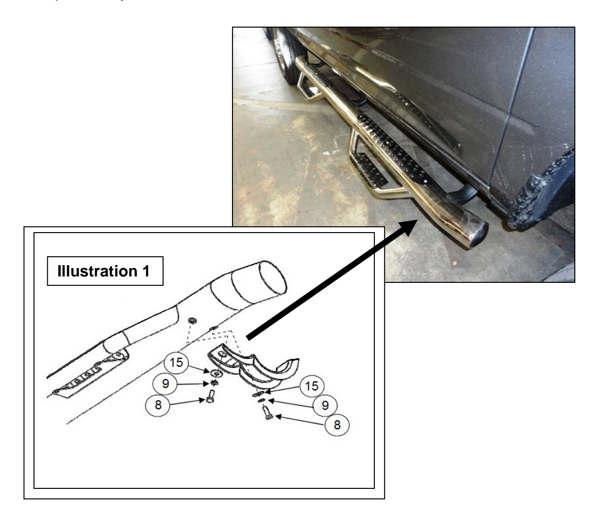
Step-10 Align the side step with the vehicle and tighten all factory, side step and bracket nuts and bolts. Repeat the installation steps to install the driver side brackets and side step. Remember to check and retighten all nuts and bolts periodically.