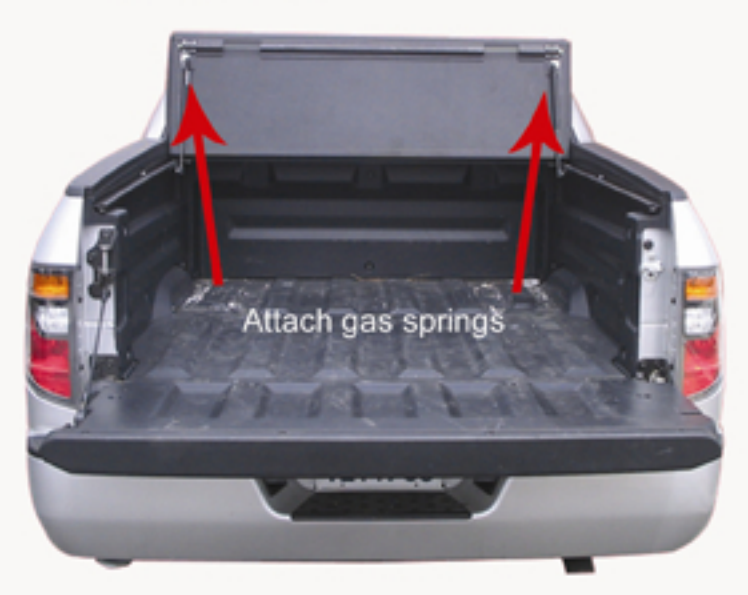
Step 6. Attach provided shocks to connectors on cover and rails. Attach drain tubes.