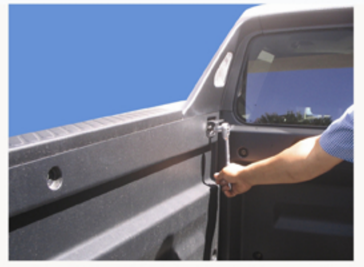
Step 1.Undo ALL 3 bolts on inside wall of truck bed