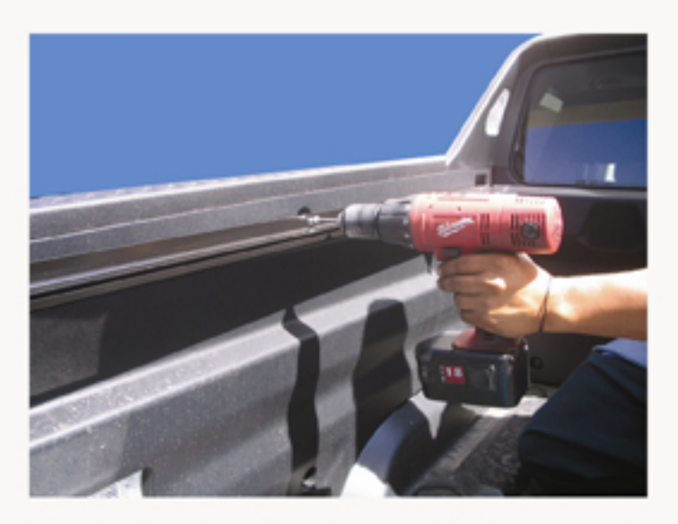
Step 2. Attach rails to side wall. Make sure rails are positioned hard up against cab wall. Use smaller diameter screws in middle and larger at front.