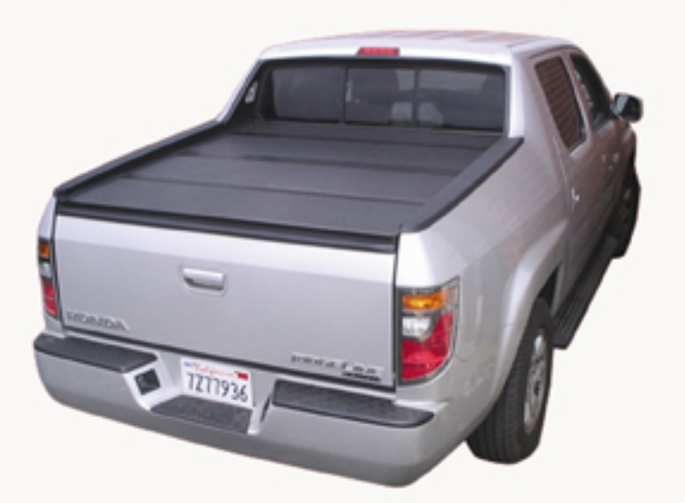
Step 3. position cover squarely on rails. Make sure the cover sits against cab and on top of tailgate.