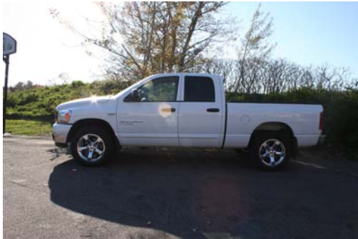
Vehicle BEFORE Installation