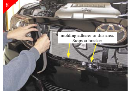
Next you will be attaching the supplied flat rubber molding. Start by test fitting the rubber molding by starting in the upper left or right corner of the grille shell. The molding will follow along the opening and stop at the first lower bracket. Remove only the necessary amount of the adhesive backing this will ensure that the molding adheres to the correct areas and not the front of your vehicle as you are trying work your way around. Repeat for other side of opening. Next step you will place the center molding.