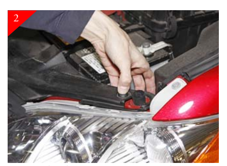
Remove the plastic core support cover by removing the (6) plastic rivets shown above. Remove the rivets by pushing on the center portion of the rivet and remove plastic. This allows you to reach behind the stock grille