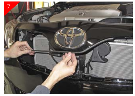
Next you will be attaching the supplied round rubber molding. Start by test fitting the rubber by centering the rubber around logo area of opening. This to get an idea as to where the rubber needs to be. Then peal the adhesive backing off and starting on one end of the rubber attach and slowly work your way around emblem area without pulling or stretching the rubber molding let it naturally follow contour of the logo area.