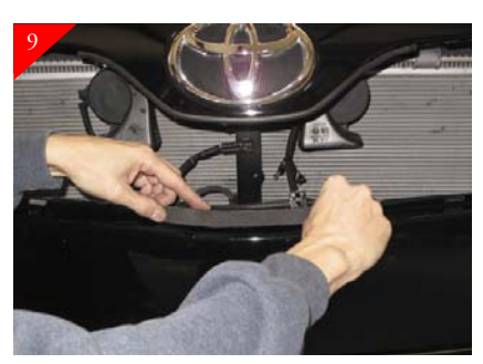
Locate the short piece of the flat molding. Test fit molding in between the two lower brackets trim in necessary. Remove adhesive backing and place as shown