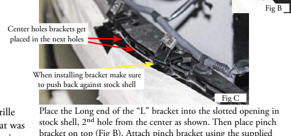
bracket on top (Fig B). Attach pinch bracket using the supplied 10-24 x 5/8" bolts and 10-24 nyloc nuts and tighten. Bracket