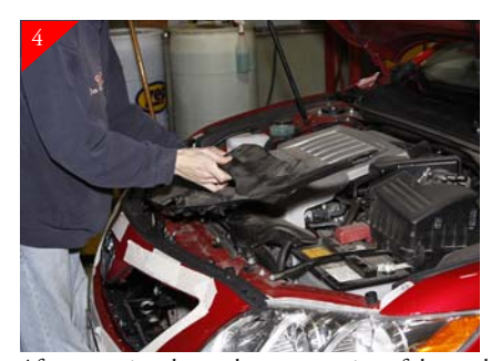
After removing the stock center portion of the stock grille shell. You can replace the plastic core support cover that was removed in Step 2. When replacing the plastic rivets omit the 2 inner rivets or the closest to the front end of vehicle. You will use these mounting holes later in the install.