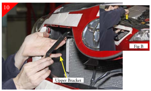
Locate the supplied upper brackets and attach. Do so by sliding the upper bracket under the plastic core support cover. Using the (2) stock mounting holes (See step 4) in core support cover for your attachment point.