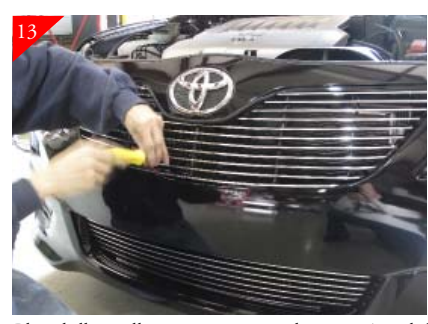
Place billet grille into opening and center. Attach billet grille by using the supplied #10-24 x 5/8" bolts and 10-24 nyloc nuts attach to the already placed upper and lower brackets. Do so by reaching down behind the stock grille shell and tighten.