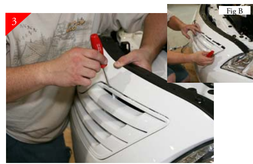
Next you will be removing the center portion of stock shell. Do so by releasing the clips that surround grille shell. Using a regular screwdriver and pushing slightly from the backside will aid in the release of the clips. Take time in releasing clips so as not to scratch painted surface. Continue working around the outside of stock grille shell releasing clips until center is free (Fig B). There are 22 clips total.