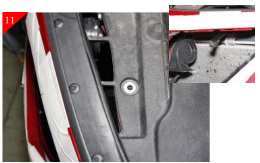
The plastic will hold bracket in place, now place supplied 10-24 fender clip on the bottom side. Followed by placing washers on the top side and attach using the 10-24~x 1" phillips head bolt shown above.