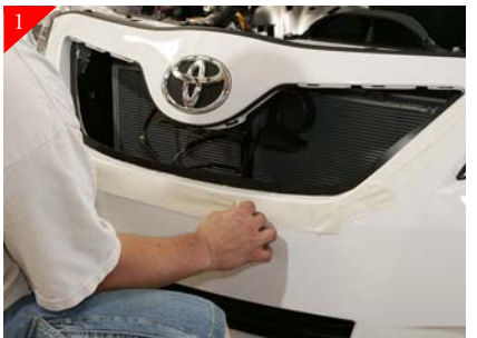
Tape front end of vehicle using masking tape to protect during install.