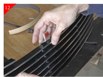
Attach the center bracket that helps align the logo area of stock shell with billet grille. Do so by attaching supplied bracket to mounting tab located in middle of the billet grille. Attach using 10-24 x 5/8" bolt and 10-24 fender clip and tighten as shown. After attaching bracket remove adhesive cover and tape.