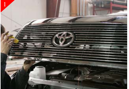
Place billet grille into opening and center. Attach billet grille by using the supplied Toggle bolt assemblies. Place bolt thru mounting tabs in billet grille then attach wing portion of toggle on bolt and tighten, without over tightening. (See Diagram)

PART# 43851 (Brushed) 43852 - (Polished) 43853 - (Black) Upper