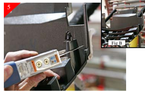
Lay stock grille shell face down on a protected work surface. Locate the (2) stock mounting clips shown above. (Fig B) shows mounting clip removed.