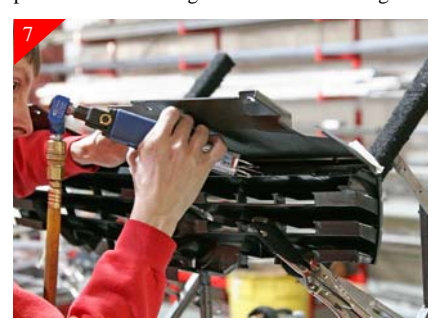
Turn stock shell over face down and cut all the vertical attachment points using an air saw or other cutting devise as shown above. Make sure and leave material so you can come back and do finish sanding.