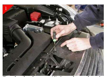
Open hood and remove (4) rivets shown above in red.