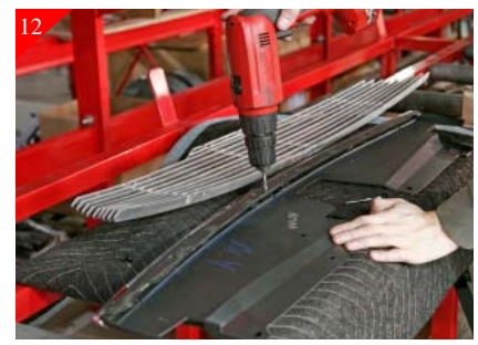
Drill the just marked hole locations using a 3/16" drill bit as shown above.