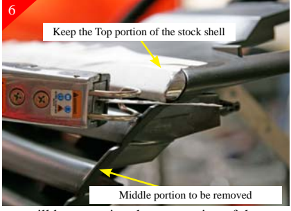
Now you will be removing the top portion of the stock shell from the middle portion. Using an air saw or other cutting devise remove starting at one corner as shown. See next step for more cutting instructions.