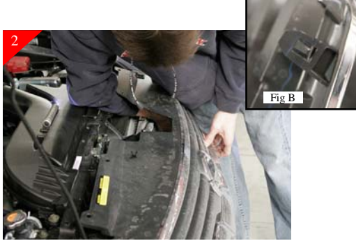
Locate the clips along bottom of stock grille shell. Release clips by lifting up and pulling outward on the shell. (Fig B) shows close up of the clips along bottom of shell. Grille shell will be free at this point.