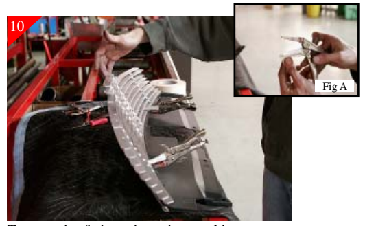
Tape a pair of vice grips using masking tape to protect during the clamping process (Fig A). Align the billet grille with the top portion of the stock shell. Then use the vice grips to clamp one end and then align and clamp the other end in place. Adjust as necessary to get the correct alignment.