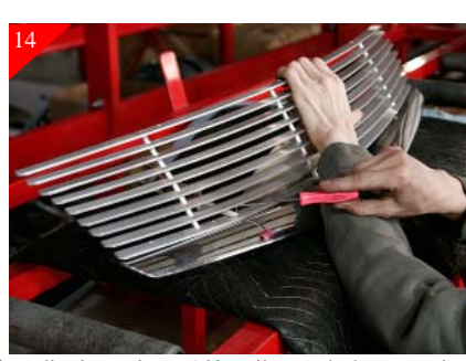
After aligning using a 90° scribe mark the mounting locations where it meet the stock shell as shown above. After marking remove billet grille.