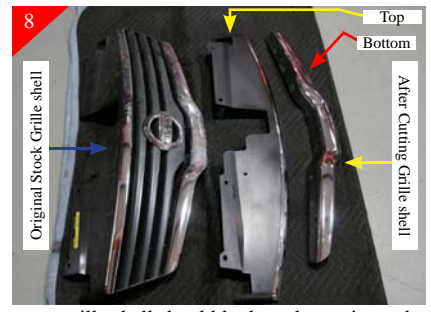
Your cut grille shell should look as those pictured on the right hand side of the above photo.