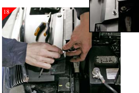
Next you will be attaching grille back to vehicle. (Ref steps 1 & 2) Place shell on vehicle and snap into place. Replace the factory rivets except for the outer (2) rivets in these locations you will fastening using the supplied 1/4-20 x 5/8" bolts and 1/4-20 Nyloc nuts with the washer going on the Top side of plastic as shown above. These bolts will allow for any adjustments that you may need to make. After adjusting tighten the (2) outer bolts.