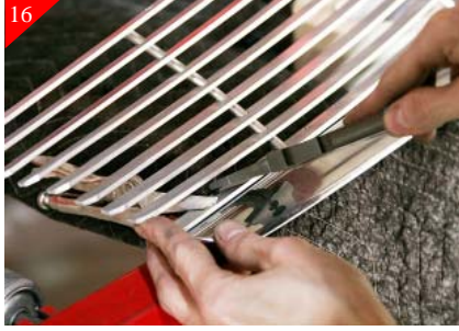
Align billet grille with the bottom portion of stock shell. Again using a pair of taped vice grips clamp in place. Using the supplied 10-32 \times 5/8 " bolts, place bolts in just drilled locations and secure with the supplied 10-32 nyloc nuts.