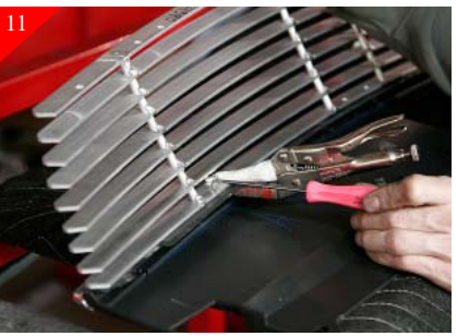
After aligning using a 90° scribe mark the mounting locations where it meet the stock shell as shown above. After marking remove billet grille.