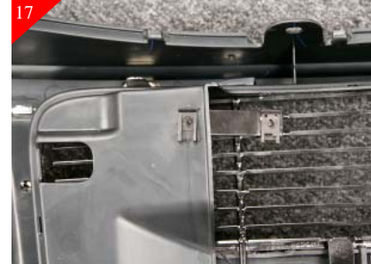
To Attach the Upper bracket locate the hole you drilled and place a supplied U-clip on the backside of plastic and attach by screwing to the U-clip as shown above. Install is complete. Center stock shell on vehicle and snap shell back in place and remember to attach all headlight connections. (Ref. steps 1-6).