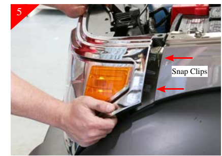
Starting on the drivers side of the vehicle. Unsnap the stock shell, when you get in started as shown above, place your hand fairly low on the shell and pull straight out on the stock shell to release from