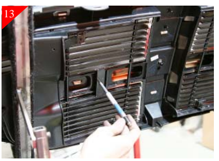
Again check the alignment of the billet grille. Then using a scribe mark the hole loaction as shown above.