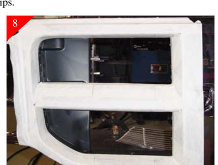
Using a sanding block or air sander