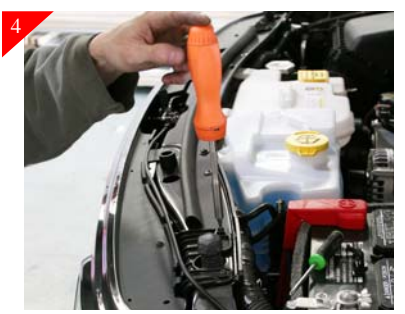
Remove (2) torx #25 screws per side holding headlights in place.

above all the vertical and horizontal attachment points holding the center portion of the stock shell. Repeat for the