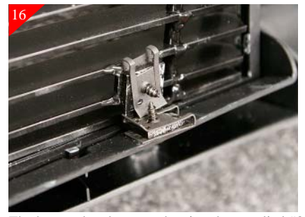
The bottom brackets attach using the supplied #8 x 5/8" Phillips head screws and U-clips as shown above.