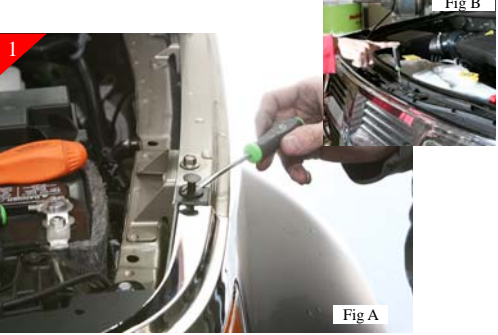
Remove (2) plastic pull pull rivets. Using a small regular screwdriver will aid in releasing as shown above (Fig A). Also remove (4) Phillips head screws from across core support as shown in (Fig B).