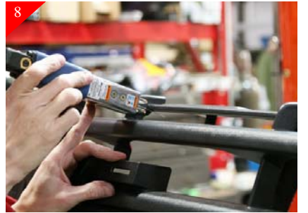
Using a air saw or other cutting devise. You will be removing the center portion of the stock shell. Cut all horizontal and vertical attachment points flush with shell. Making sure to leave enough material to do finish sanding. See (step 9) for more cutting images.