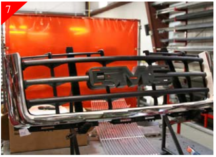
Move stock grille shell to a protected work surface. Using masking tape, tape the chrome portions of stock grille shell to protect during install.