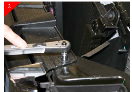
Remove the (4) 10mm nuts from top of stock grille shell.