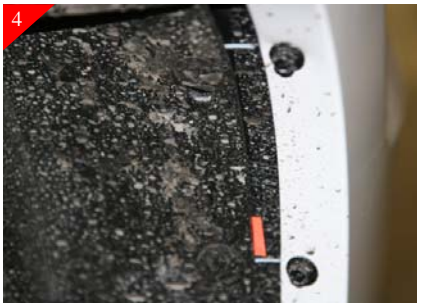
Locate the (2) bolt in the wheel wells for both the drivers and passengers side of vehicle and remove.