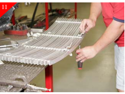
loosely attach the (2) bottom brackets using the supplied 1/4-20 \times 1'' Bolt and 1/4-20 Nyloc nuts shown above.