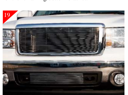
Verify the grille is still centered in the grille shell and tighten all bolts.