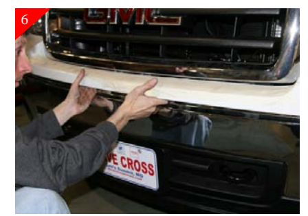
Moving out to the center of the painted bumper area again pull out to release the clips. Now at this point you will be able to separate the stock chrome shell from the bumper. Grille shell will be free at this point.