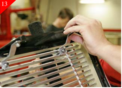
Now loosely attach the remaining (2) upper brackets to billet grille using the supplied 1/4-20 x 1" bolts & 1/4" Flat washers and 1/4-20 Nyloc nuts. The washer go on the head side of the bolt or on top of plastic.