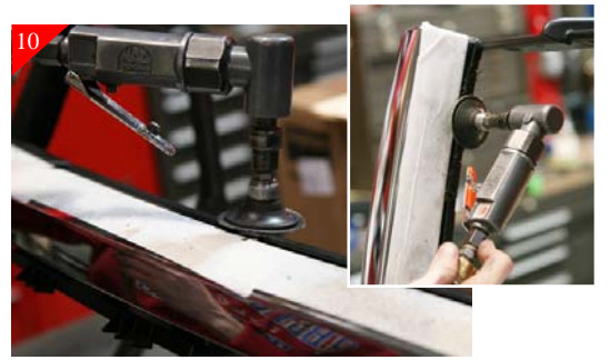
Sand all cut areas smooth using a air sander or sanding block as shown above.