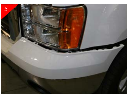
Starting at the corner of the bumper pull out on the painted portion of the bumper grille to release the clips holding in place.