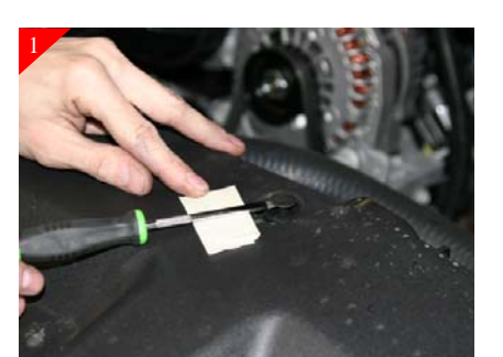
Remove the (4) plastic push pull rivets from along top of core support.