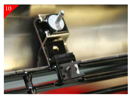
Attach Top brackets to billet grille using the supplied U-clips and \#8 \ge 5/8 " Phil pan head screws as shown above. Using a scribe mark the hole locations where it meet the stock shell. Drill just marked holes using a 3/16" drill bit.