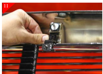
Place supplied U-clips on the just drilled hole locations. Now attach bracket to stock shell using supplied #8 x 5/8" Phil pan head screws.