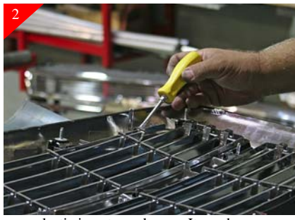
Un-snap plastic inserts as shown. It maybe necessary to use a regular screwdriver to aid in the release of the clips.