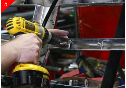
Now drill a 3/16" hole in the just marked locations.