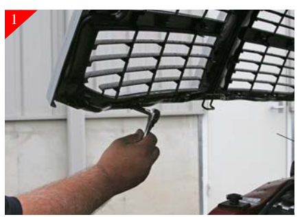
Start with removing the (12) 8mm. Bolts from the backside of the stock grille shell as shown. Grille shell will be free at this point. With shell removed tape the face of the grille shell to protect during install.