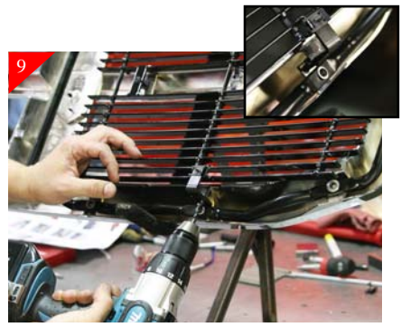
After attaching brackets mark the location of the holes using a scribe. Then using a 3/16" drill bit drill the just marked locations. After drilling place a supplied U-clip on the just drilled location. Then attach bracket using supplied #8 x 5/8" Phil pan head screws. (Fig B.) shows the final attachment of the bottom bracket.