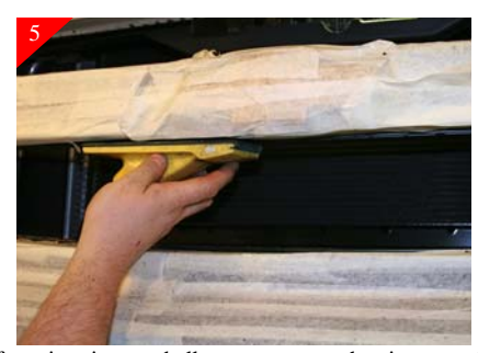
After trimming sand all cut areas smooth using a sanding block.