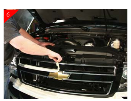
After sanding remove the masking tape from stock shell, leaving tape along bumper as shown.