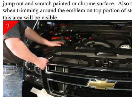
Remove (6) 10mm. bolt from along core support area. This will alow you to reach behind the stock shell.