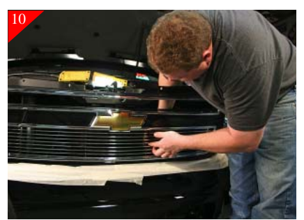
Place the supplied brackets on the backside of grille shell and tighten using the supplied 1/4-20 nyloc nut. It's recommended to start all the nuts before tightening.