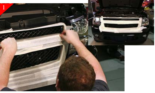
Open Hood. Then tape the stock grille shell to protect during install as shown above.