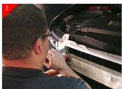
Remove the "Egg Crate" section by using a pair of dykes to snip out as shown above. You are just removing the bulk of the "egg crate" section as much as you can.