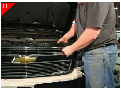
Place the top billet grille in place and center. Then attach using the same method of attachment as the bottom billet grille (steps 8 thru 10). After tightening re-install the (6) 10mm. bolts that were removed in step 7.