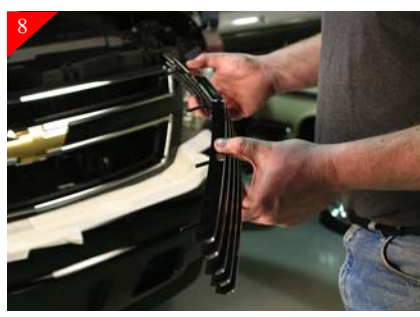
Place the supplied bolts in bottom billet grille as shown above. Then place billet grille into opening and center.