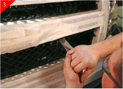
Repeat the cutting process for the bottom portion of the stock grille shell as shown above.