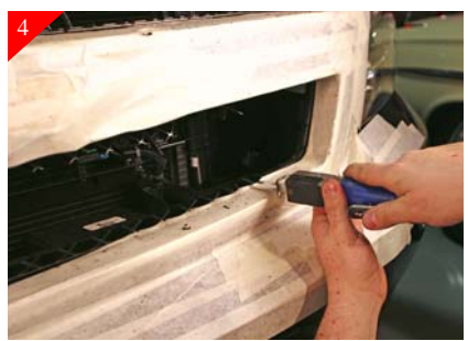
Using a hack saw go back and trim all the cut areas or if using a air saw as shown above, take care in trimming as the saw can jump out and scratch painted or chrome surface. Also take care when trimming around the emblem on top portion of stock shell as this great will be vicible.