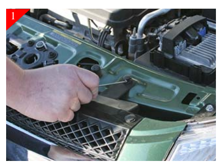
Remove (8) plastic rivets by pulling up on the inner portion of the rivet as shown above. Then slightly pull out on the top portion of the stock shell to release the clips holding shell in place.