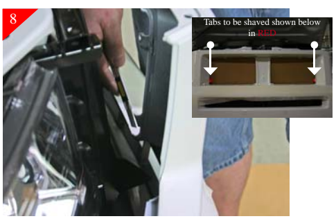
With center section removed, you will need to shave off the raised section of the BACKSIDE of the bottom (2) tabs. Lean the grille shell forward and then using a utility knife shave off the raised sections as shown above.