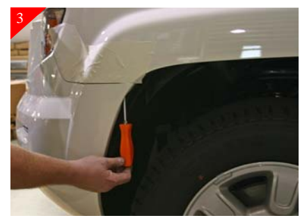
Remove (1) Phillips head bolt per side of vehicle as shown above.