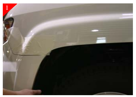
Tape both driver & passenger sides of front fenders as shown using masking tape to protect during install.