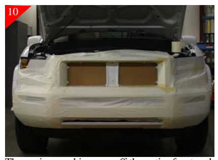
Then using masking off the entire front end. NOTE: TAKE TIME to ensure that no over spray get on vehicle. You may want to use 4" wide tape to make taping faster and then use 3/4" to get into the corners.