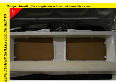
Using the shipping box that the billet grille came in cut a section to fit behind opening as shown above. Then using stock screws, push screws into cardboard to hold in place.