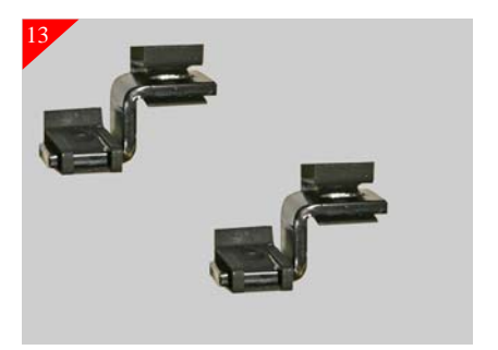
Next place supplied u-clips on both ends of the supplied brackets as shown.