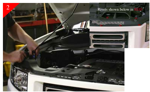
Next open hood and remove the (9) Plastic push-pull rivets along plastic shroud that cover core support. Then remove the (3) plastic push-pull rivets holding air induction as shown. Plastic shroud will be free at this point.