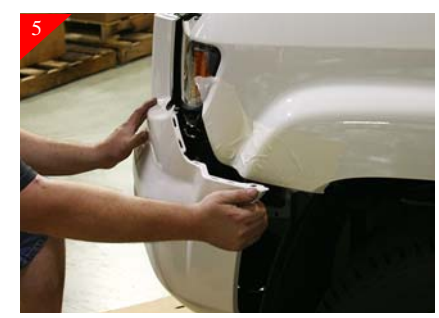
Then slightly pull outward on the front end as shown to release. The front end will un-snap at this point, but will still be attached by the (2) center bolts on the bottom front.