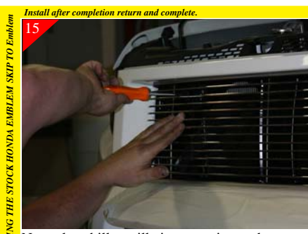
Next place billet grille into opening and center. Then attach the billet grille to the brackets as shown using the supplied #8 x 5/8" Phillips head pan screw.