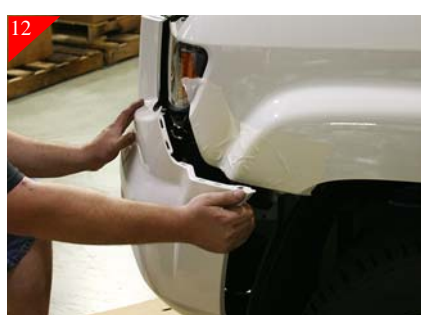
After paint has dried remove cardboard and snap the front end back to vehicle and attach using the 10mm bolts.