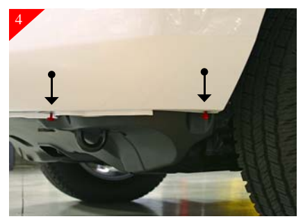
Then remove the (2) 10mm bolts per side of vehicle as shown above. (Bolts are shown in RED.)