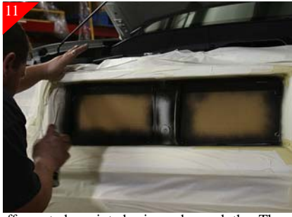
Wipe off area to be painted using a damp cloth.. Then using Flat Black paint center section as shown. Let paint fully dry then a second coat maybe necessary. Remove 1 screw at a time and quickly paint where screw was while holding cardboard. You also will want to hold the backside of cardboard during painting of the screw holes.