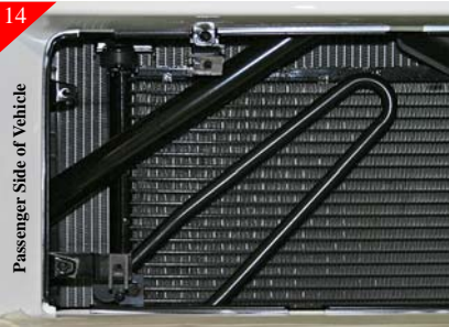
Attach the bottom bracket as shown long end of the bracket to the truck. Attach the top bracket as