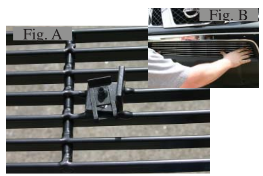
Start by attaching U-clip to bracket. U-clip attached on the slotted hole side of bracket (Fig. A). The round hold attaches to truck. Then attach bracket to Billet Grille using #8 x 5/8" Phil Pan Head screw. Next place billet bumper grille into opening and center (Fig B).