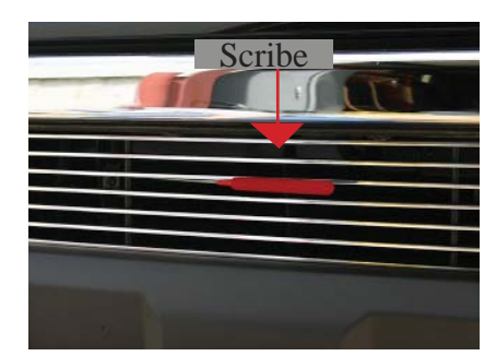
Using a Scribe mark the locations of the Brackets against the plastic fins as shown above. After marking remove the grille and remove the brackets from the billet grille. The drill a 3/16" hole in each of the marked locations.