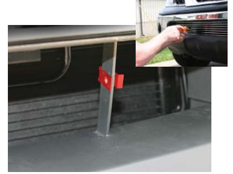
Next place the u-clip on plastic fin as shown above. The u-clip must go on from the backside. Then attach the brackets to the u-clips. Place billet grille back into opeing a center then attach billet grille to the brackets using \#8 \times 5/8 " Phil Pan head screw.