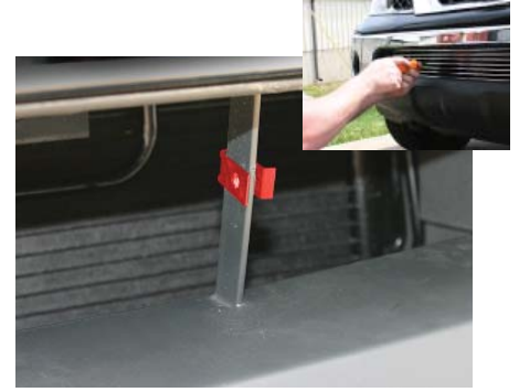
Next place the u-clip on plastic fin as shown above. The u-clip must go on from the backside. Then attach the brackets to the u-clips. Place billet grille back into opeing a center then attach billet grille to the brackets using \#8 \times 5/8 " Phil Pan head screw.