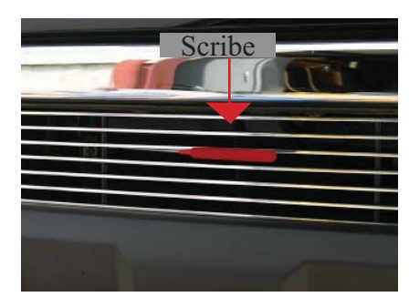
Using a Scribe mark the locations of the Brackets against the plastic fins as shown above. After marking remove the grille and remove the brackets from the billet grille. The drill a 3/16" hole in each of the marked locations.