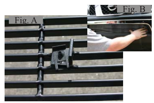
Start by attaching U-clip to bracket. U-clip attached on the slotted hole side of bracket (Fig. A). The round hold attaches to truck. Then attach bracket to Billet Grille using #8 x 5/8" Phil Pan Head screw. Next place billet bumper grille into opening and center (Fig B).