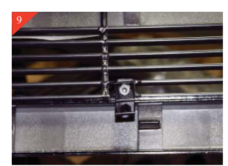
Loosely attach the (L) shaped brackets to the bottom of billet grille, with the short side of bracket attaching to billet grille as shown above.