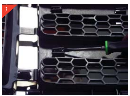
Tape off the face of the stock grille shell using masking tape. This will protect grille shell during install. Next lay shell face down on a protective surface. Then using a flat blade screwdriver pry out to release all clips holding center sections of stock grille shell as shown above