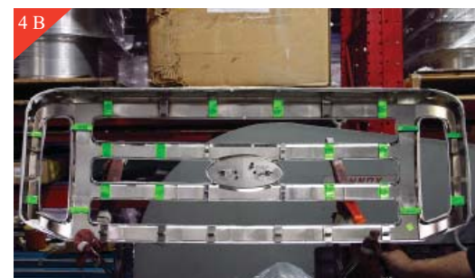
(Fig. 4B) All the tabs marked in GREEN need to be removed