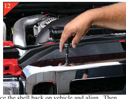
Place the shell back on vehicle and align. Then replace the stock 7/32" bolts that attach across the top of shell.

Then replace rubber core support cover using stock plastic rivets. Installation is complete.