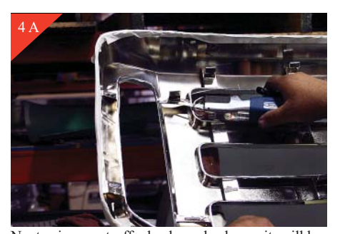
Next using a cut-off wheel or a hack saw it will be necessary to remove some of the tabs (Fig 4A). The next step (Fig. 4B) shows the tabs that need to be removed.