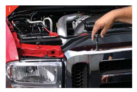
Open hood and remove the (4) 7/32" bolts holding stock grille shell in place. Then remove rubber core support cover by pulling up on the plastic rivets.