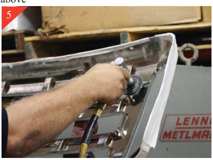
After the tabs have been removed, you will need to sand or grind all the cut areas smooth with shell.