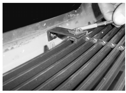
STEP 7 Place the Long L-Brackets on the top of the grille as shown and mark locations of slots in brackets & drill a 1/8" hole. Attach brackets using supplied hardware.Re-install the grille shell to the vehicle. Installation is complete.

For installation of billet grilles that require cutting of the stock shell, proper tools, knowledge and skill are needed. Carriage Works is not responsible for care & accuracy of the installation, only for Fit & Finish of its products. Use a qualified installer or contact original vendor for references to complete all instructions.