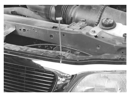
STEP 2 Then remove the 6 screws from the top of the grille shell.