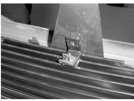
STEP 6 Now place the billet grille into the back of grille shell. Center the grille in the opening. Place the Short L-Brackets on the tabs at the Bottom of the grille and mark location of the the slots & drill a 1/8" hole. Attach using supplied screws.