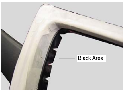
STEP 3 Grind or sand ring around perimeter of the shell smooth. Note: Be sure not to cut the black area away as shown above.