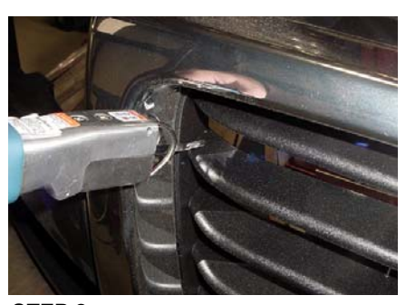
STEP 2 Using a cut-off wheel or hacksaw, remove the horizontal center bar section. Note: Do not remove the small black ring around the perimeter of the shell.