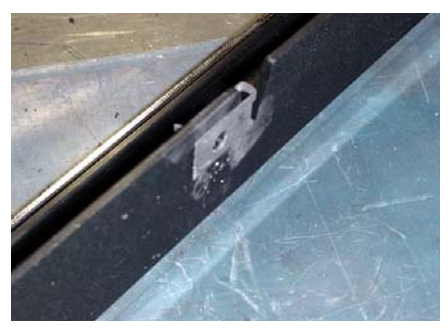
Step 6 Use Blk. #8 x 5/8" Phillips Pan Head Screws to attach billet grille. Center Billet grille in shell and tighten screws.

NOTE: Please adjust horizontal blades if irregular. This is the result of shipping and handling outside of Carriage Work's control.