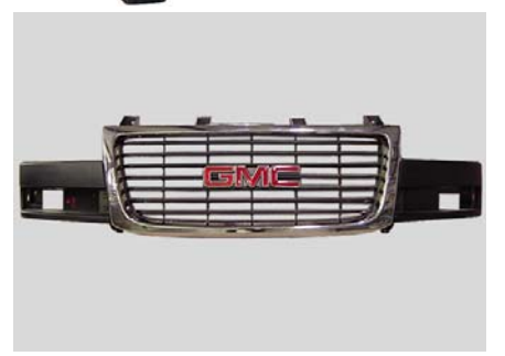
STEP 1 Remove stock grille shell form vehicle. Next tape off chrome areas to prevent any scratching of the stock grille shell during installation.