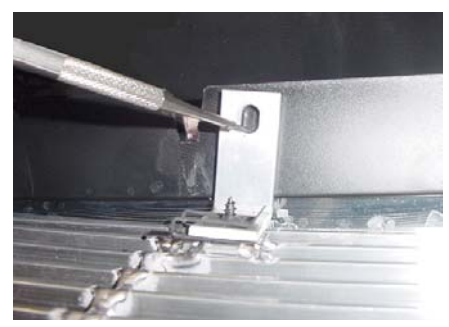
STEP 5 Set billet grille in shell with back edge of grille sitting against black lip in shell and mark location of slot in 4 places. Then drill 1/8" holes and attach U-Clips to grille shell.