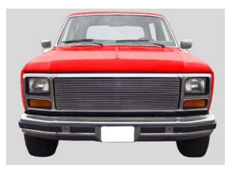
STEP 5 Attach billet grille to brackets (step 3) using #8 x 5/8" Phillips Pan Head Screws & U-Clips.

NOTE: Please adjust horizontal blades if irregular. This is the result of shipping and handling outside of Carriage Work's control.