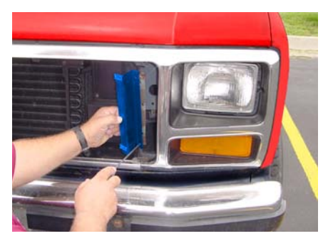
STEP 3 Attach brackets to vehicle as shown (Bracket shown in Blue). Using factory clips & supplied #8 x 5/8" phillips pan head screws.

STEP 2 Next you will be attaching the brackets for mounting the billet grille. Take note of the top hole in bracket this must point inward (Left bracket Shown).