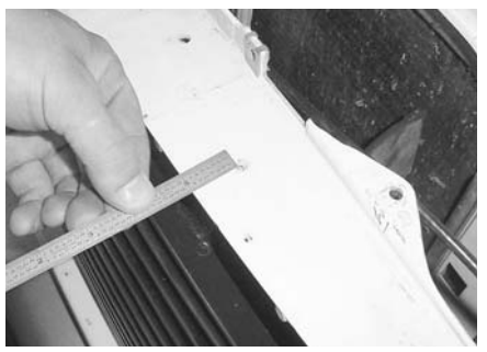
STEP 4 Mark hole location on top of core support 1" from the edge as shown.