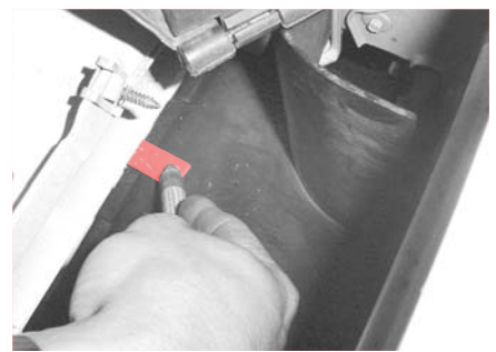
STEP 3 Drill an 1/8" hole in the lower marked positions.