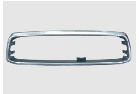
STEP 1 Remove grille shell from truck and using masking tape to tape off the chrome or painted surface of the grille shell. To protect from scratching the face of the shell during install.