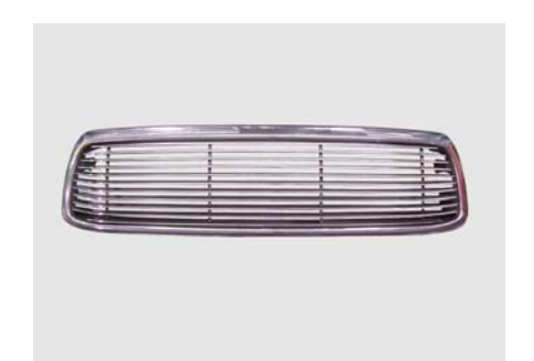
STEP 6 Attach billet grille with remaining hardware and re-install the grille shell to truck.

NOTE: Please adjust horizontal blades if irregular. This is the result of shipping and handling outside of Carriage Work's control.