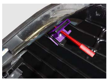
STEP 5 Center billet grille in grille shell and mark locations of holes as shown above. Then drill a 1/8" hole for each.