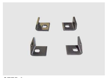
STEP 3 Layout brackets as shown. Top left bracket is the top left bracket as attached to grille.