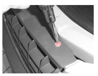
STEP 1 Remove the 4 plastic rivets along top of grille shell.