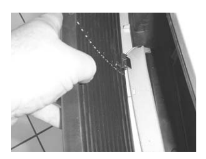
STEP 4 Set billet grille into opening and center. Make sure that the bottom bracket goes behind the bottom lip on core support.