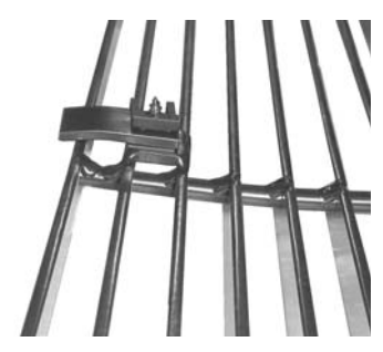
STEP 3 Place U-Clips on brackets. Then attach the short brackets to the bottom tabs of billet grille. With the angle of the bracket going toward the front of the truck. Attach long brackets to the top of billet grille.