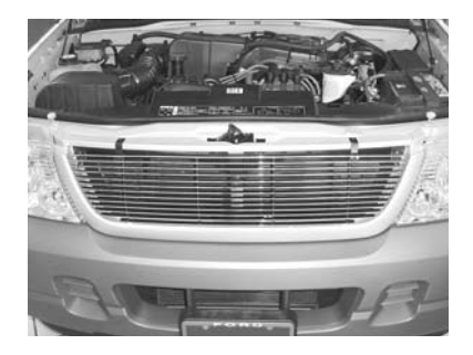
STEP 6 Now attach grille with (#8 x 5/8" phillips pan head) to each of the drilled locations in step 5.