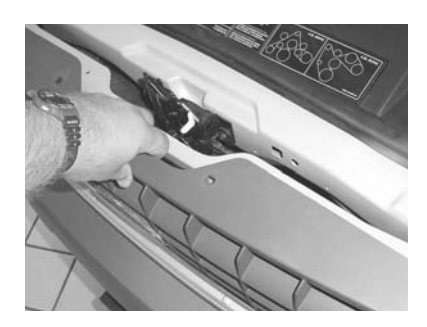
STEP 2 Remove stock grille shell by pulling up & out.