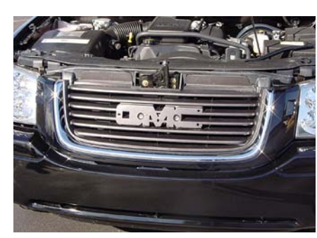
STEP 2 Next remove the GMC Logo from the grille shell by removing the nuts on the backside of the grille shell.