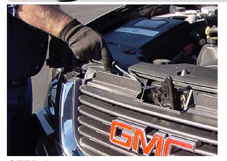
STEP 1 Open hood and using a flat blade screwdriver, release the four snap in clips retaining the top of your grille shell to the core support (see above). Gently lift up on the grille shell & remove the grille shell from the truck.