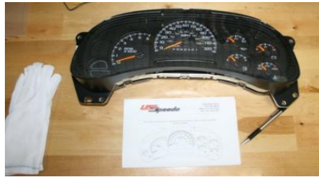
2. Make sure you have the needle positions marked. Should all be at low.