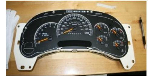
4. Cluster with the lens off.