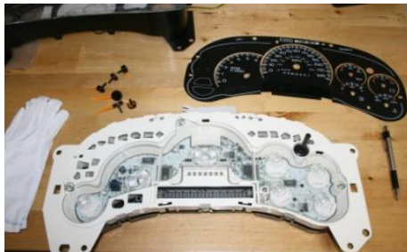
10. Remove the factory gauge face.