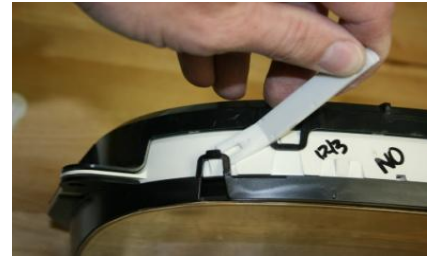
3. Use the needle tool to help remove the clear lens.