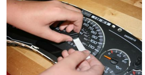
8. If the needles are hard to remove, twist and lift at the same time.