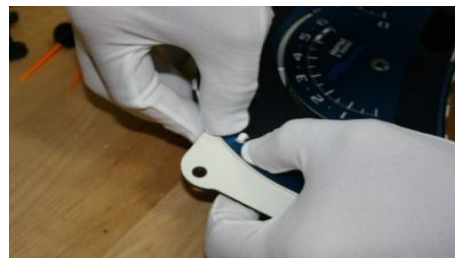
15. Push the alignment tabs in place.