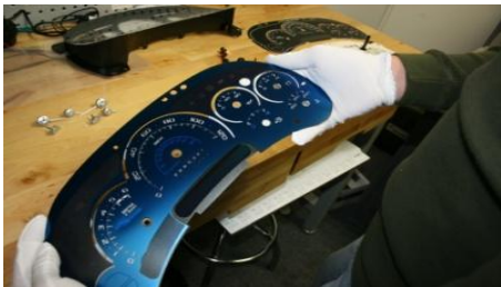
13. Put on the gloves before touching the stainless steel.