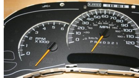
6. This will break the needle free from the shaft of the stepper motor.