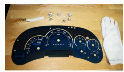
12. Only the SS and Aqua Kits come with gloves to protect from fingerprints.