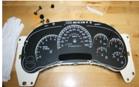
9. Remove all the needles.