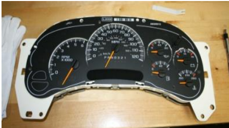
5. Twist each needle down past the low mark.