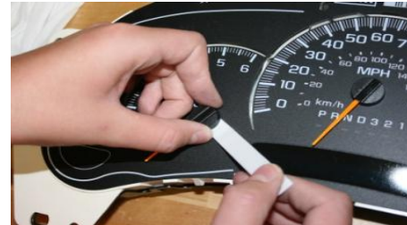
7. Use the needle tool to remove the needles.