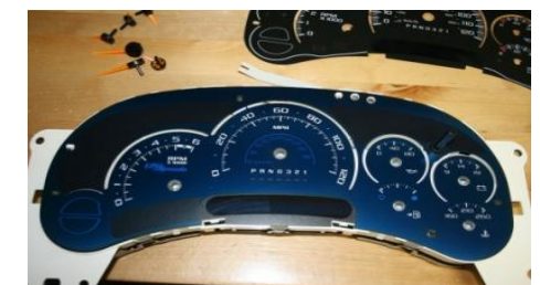
16. Place the New US Speedo Gauge Face in place.