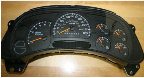
1. Bring cluster inside to a clean area to start the install.