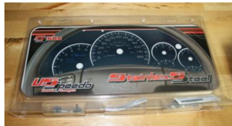
11. Open the US Speedo gauge face package.