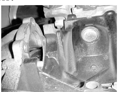
REMOVE THE MANIFOLDS ATTACHING STUDS.

BOLTS NEEDED TO BE REMOVED FOR REMOVAL OF THE STARTER.