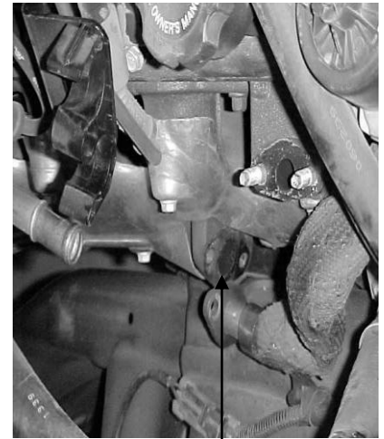
EGR TUBE FITTING

10) REINSTALL THE DIPSTICK TUBE, THE SPARK PLUGS AND WIRES. USING THE SUPPLIED FASTENERS, RECONNECT THE HEADERS TO THE STOCK EXHAUST UNDERNEATH THE VEHICLE.