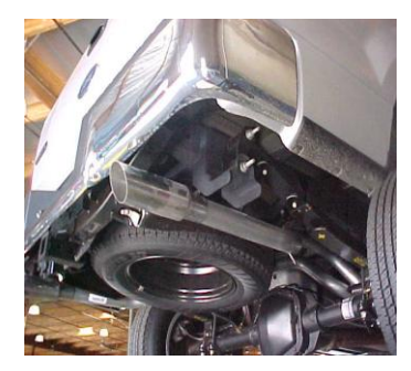
INSTALL YOUR STAINLESS TIPS TO YOUR DESIRED LOOK, THEN GO BACK AND TIGHTEN ALL CLAMPS. ROTATE SYSTEM FOR BEST CLEARANCE BEFORE TIGHTENING.

INSTALL EXIT PIPES # E ONTO TAILPIPES. ROTATE UNTIL LEVEL, USE CLAMP # H TO SECURE PIPES TOGETHER. DO NOT TIGHTEN.