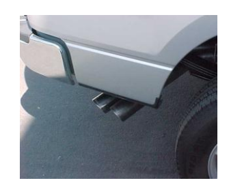
INSTALL YOUR STAINLESS TIPS TO YOUR DESIRED LOOK. NOW GO BACK AND TIGHTEN ALL CLAMPS FROM THE FRONT WORKING YOUR WAY BACK.

INSTALL MUFFLER # B ONTO HEADPIPE 1 \frac{1}{2} " TO 2". USE CLAMP # F TO SECURE MUFFLER TO HEADPIPE. DO NOT TIGHTEN. USE A JACK STAND TO HOLD UP THE MUFFLER. OUTLETS SHOULD BE LEVEL.