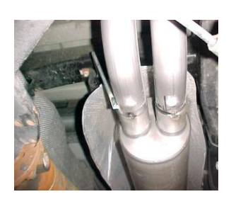
INSTALL DRIVERS SIDE TAILPIPE # D INTO MUFFLER 1 \frac{1}{2} " TO 2". INSERT HANGERS INTO RUBBER GROMMETS, USE CLAMP # G TO SECURE PIPE TO MUFFLER. DO NOT TIGHTEN. THE TAB ON THIS PIPE SHOULD GO ON BOTTOM OF PASSENGER SIDE PIPE USE BOLT KIT # H TO SECURE TOGETHER.

INSTALL HEADPIPE # A INTO STOCK PIPE. THE END OF THE PIPE SHOULD BE AT THE 12 O'CLOCK POSITION, ATTACH WITH FACTORY CLAMP. DO NOT TIGHTEN. INSERT WELDED HANGER INTO RUBBER GROMMET.