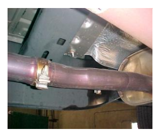
TO REMOVE YOUR STOCK EXHAUST, REMOVE IT FROM THE CLAMP LOCATED JUST IN FRONT OF THE MUFFLER REMOVE HANGERS FROM RUBBER GROMMETS BY PULLING EXHAUST TOWARDS THE REAR OF THE VEHICLE, USE WD-40 TO AID IN REMOVAL, LEAVE GROMMETS IN PLACE.