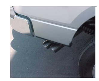
INSTALL YOUR STAINLESS TIPS TO YOUR DESIRED LOOK. NOW GO BACK AND TIGHTEN ALL CLAMPS FROM THE FRONT WORKING YOUR WAY BACK.