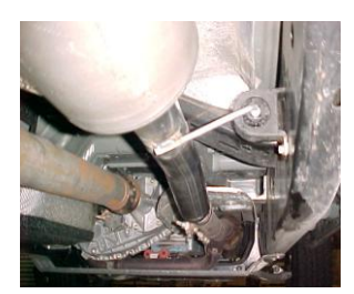
INSTALL HEADPIPE # A INTO STOCK PIPE. THE END OF THE PIPE SHOULD BE AT THE 12 O'CLOCK POSITION, ATTACH WITH FACTORY CLAMP. DO NOT TIGHTEN. INSERT WELDED HANGER INTO RUBBER GROMMET.

INSTALL DRIVERS SIDE TAILPIPE # D INTO MUFFLER 1 ½" TO 2". INSERT HANGERS INTO RUBBER GROMMETS, USE CLAMP # G TO SECURE PIPE TO MUFFLER. DO NOT TIGHTEN. THE TAB ON THIS PIPE SHOULD GO ON BOTTOM OF PASSENGER SIDE PIPE USE BOLT KIT # H TO SECURE TOGETHER.