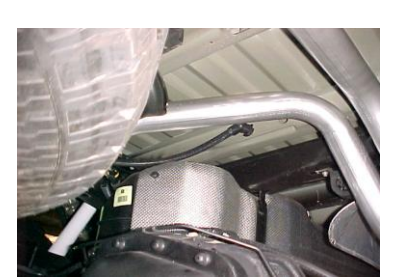
INSTALL DRIVERS SIDE TAILPIPE # D INTO MUFFLER 1 ½" TO 2". INSERT WELDED HANGERS INTO RUBBER GROMMETS. USE CLAMP # H TO SECURE PIPE TO MUFFLER, DO NOT TIGHTEN.

TO REMOVE YOUR STOCK EXHAUST, REMOVE IT FROM THE 2-BOLT FLANGE LOCATED JUST IN FRONT OF THE MUFFLER REMOVE HANGERS FROM RUBBER GROMMETS BY PULLING EXHAUST TOWARDS THE REAR OF THE VEHICLE, USE WD-40 TO AID IN REMOVAL, LEAVE GROMMETS IN PLACE.