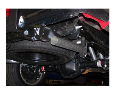
INSTALL EXIT PIPES # E ONTO TAILPIPES. ROTATE OUT TO THE SIDES; ATTACH TO TAILPIPES WITH CLAMPS # H.