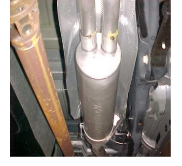
INSTALL MUFFLER # B ONTO HEADPIPE 1 ½" TO 2". USE CLAMP '# G TO SECURE MUFFLER TO HEADPIPE. DO NOT TIGHTEN. USE A JACK STAND TO HOLD UP THE MUFFLER. OUTLETS SHOULD BE LEVEL.

INSTALL PASSENGER SIDE TAILPIPE # C INTO MUFFLER 1 ½" TO 2". INSERT WELDED HANGER INTO RUBBER GROMMET, USE CLAMP # H TO SECURE PIPE TO MUFFLER. DO NOT TIGHTEN. ROTATE PIPE TOWARDS DRIVERSIDE.