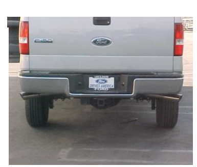
INSTALL YOUR STAINLESS TIPS TO YOUR DESIRED LOOK THEN GO BACK AND TIGHTEN ALL CLAMPS, ROTATE SYSTEM FOR BEST CLEARANCE BEFORE TIGHTENING.

MAKE SURE YOU AT LEAST A 1" CLEARANCE ON ALL BRAKE LINES, FUEL LINES, SHOCKS, TIRES, ETC. USE ZIP TIES TO TIE BRAKE LINES OUT OF THE WAY.