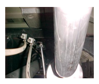
INSTALL BAND CLAMP # I ONTO MUFFLER, INSERT HANGER INTO RUBBER GROMMET, USE BOLT KIT PROVIDED, DO NOT TIGHTEN.

INSTALL MUFFLER # C ONTO YOUR RESONATOR 1 ½" –2". USE CLAMP # G TO SECURE MUFFLER TO THE PIPE, DO NOT TIGHTEN.