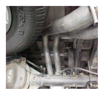
INSTALL PASS. SIDE TAILPIPE # E INTO MUFFLER 1 ½"-2". USE CLAMP # H TO SECURE PIPE TO MUFFLER, DO NOT TIGHTEN.