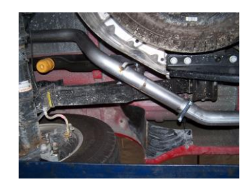
5. Install the passenger side overaxle tailpipe #C into the muffler 1\frac{1}{2} "-2". Use clamp #Hto secure tailpipe to muffler. DO NOT TIGHTEN. Insert hanger into rubber grommet.

9. Install stainless steel tips. Clamp down. When you have everything in place, firmly tighten all bolts and clamps down securely. Use stainless steel cleaner and a Scotch Brite pad weekly to prevent tip from discoloration. Inspect all fasteners after 25-50 miles of operation and re-tighten as necessary