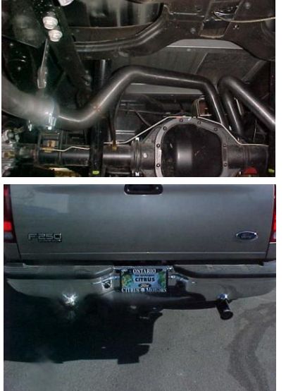
NEXT INTALL EXIT PIPES #E ONTO OVERAXLE PIPES. USE CLAMPS #I. SECURE EXIT PIPE TO OVERAXLES.