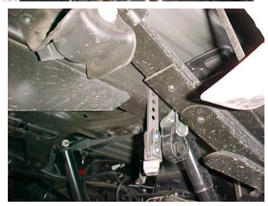
NEXT, INSTALL DRIVERS SIDE OVERAXLE PIPE #D INTO MUFFLER 1 <sup>1</sup>/<sub>2</sub>" TO 2". USE CLAMP #I TO SECURE PIPE TO MUFFLER. DO NOT TIGHTEN. ROTATE PIPE UNTIL IT TOUCHES HANGER. USE CLAMP #I TO HOLD PIPE TO HANGER DO NOT TIGHTEN.