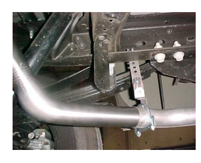
INSTALL PASSENGER SIDE OVERAXLE PIPE #C INTO MUFLER 1 <sup>1</sup>/<sub>2</sub>" TO 2". USE CLAMP # I TO SECURE. DO NOT TIGHTEN. ROTATE UNTIL PIPE TOUCHES HANGER. USE CLAMP #I TO HOLD PIPE TO HANGER #J. DO NOT TIGHTEN.