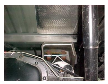
NEXT, LOCATE THE SLOTED HOLES LOCATED APPROXIMATELY 16" FROM THE REAR OF THE FRAME. MOUNT THE 10" STRAP HANGERS #J INTO THESE SLOTS USING THE HARDWARE PROVIDED. MOUNT USNG THE 2<sup>ND</sup> HOLE FROM THE TOP.

INSTALL MUFFLER #B ONTO HEADPIPE 1 ½" TO 2". MUFFLER OUTLETS SHOULD BE ON TOP. ROTATE UNTIL LEVEL. SUPPORT MUFFLER WITH A JACK STAND. NEXT INSTALL FRONT MUFFLER HANGER #F INTO RUBBER GROMMETS, LOCATED NEXT TO MUFFLER INLET. THIS CLAMP WILL ALSO BE USED TO SECURE MUFFLER TO HEADPIPE. DO NOT TIGHTEN.