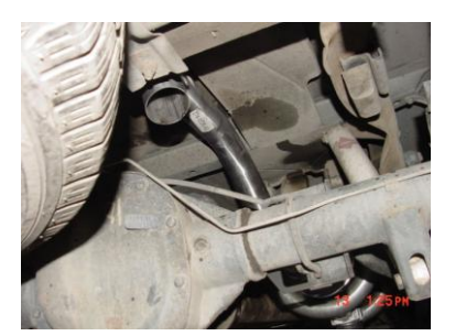
INSTALL DRIVERSIDE FRONT TAILPIPE #D INTO MUFFLER 1-1/2" TO 2". SECURE TO MUFFLER WITH HANGER # G. INSTALL TAILPIPE #E ONTO FRONT PIPE, USE CLAMP #I TO SECURE TOGETHER. DO NOT TIGHTEN.

INSTALL HEADPIPE #A ONTO FACTORY PIPE USING CLAMP #K TO SECURE TOGETHER. DO NOT TIGHTEN.