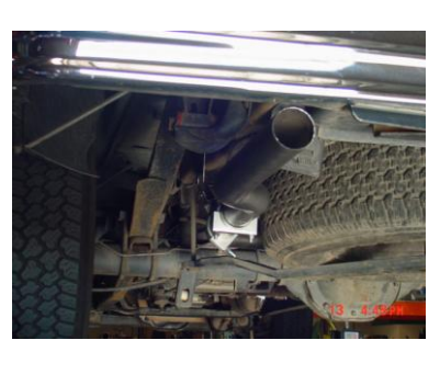
INSTALL EXIT PIPES #F ONTO TAILPIPES, ROTATE THE PIPE UNTIL IT IS AT THE PROPER LOOK FOR YOU. USE CLAMPS #I TO SECURE PIPES TOGETHER. DO NOT TIGHTEN.

INSTALL MUFFLER #B ONTO HEADPIPE 1-1/2" TO 2". OUTLET SHOULD BE LEVEL. USE CLAMP #J TO SECURE MUFFLER TO HEADPIPE. DO NOT TIGHTEN. INSTALL REAR MUFFLER HANGER #G ONTO THE DRIVERSIDE MUFFLER OUTLET. INSERT HANGERS INTO RUBBER GROMMETS. DO NOT TIGHTEN.