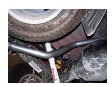
6. Install the driverside overaxle tailpipe #D into the muffler 1½-2". Use clamp #H to secure. DO NOT TIGHTEN. Rotate until it meets with the rubber grommet. DO NOT TIGHTEN.