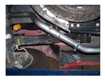
4. Install the passenger side overaxle tailpipe #C into the muffler 1½"-2". Use clamp #H to secure tailpipe to muffler. DO NOT TIGHTEN. Insert hangers into rubber grommets.

7. Next install the exit pipes #E. Use clamp #H to secure. DO NOT TIGHTEN. Rotate pipes to your desired look.