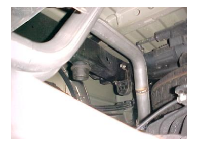
INSTALL PASSENGER SIDE TAILPIPE # C INTO MUFFLER 1\frac{1}{2} " TO 2". INSERT WELDED HANGER INTO RUBBER GROMMET, USE CLAMP # H TO SECURE PIPE TO MUFFLER. DO NOT TIGHTEN. ROTATE PIPE TOWARDS DRIVERSIDE.

INSTALL DRIVERS SIDE TAILPIPE # D INTO MUFFLER 1 ½" TO 2". INSERT WELDED HANGERS INTO RUBBER GROMMETS. USE CLAMP # H TO SECURE PIPE TO MUFFLER, DO NOT TIGHTEN.