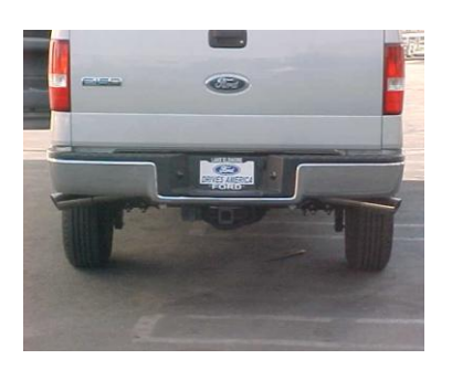
INSTALL YOUR STAINLESS TIPS TO YOUR DESIRED LOOK THEN GO BACK AND TIGHTEN ALL CLAMPS, ROTATE SYSTEM FOR BEST CLEARANCE BEFORE TIGHTENING.

MAKE SURE YOU AT LEAST A 1" CLEARANCE ON ALL BRAKE LINES, FUEL LINES, SHOCKS, TIRES, ETC. USE ZIP TIES TO TIE BRAKE LINES OUT OF THE WAY.