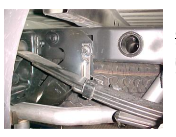
ON PASSENGERSIDE: ATTACH REAR TAILPIPE HANGER #J TO FRAME BY REMOVING THE 18MM HITCH BOLT. THEN RE INSTALL BOLT WITH HANGER