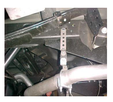
ON DRIVER SIDE MEASURE 17-1/2" FROM THE REAR OF THE FRAME FORWARD. USE HANGER # I. USE THE TOP HOLE OF THIS HANGER. USE HARDWARE PROVIDED. REPEAT FOR PASS. SIDE.

INSTALL MUFFLER ONTO HEADPIPE AT LEAST 1.5" TO 2", AND ATTACH USING CLAMP #H.. USE A JACKSTAND TO SUPPORT THE MUFFLER. DO NOT TIGHTEN.