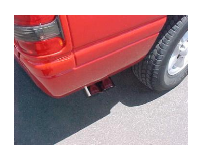
INSTALL THE STAINLESS TIPS. NOW GO BACK AND START AT THE FRONT AND TIGHTEN ALL CLAMPS AND HANGERS.