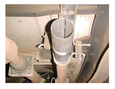
INSTALL HEADPIPE # A AND ATTACH TO THE STOCK EXTENSION PIPE USING CLAMP #F

INSTALL REAR MUFFLER HANGER #H ON THE DRIVERSIDE MUFFLER OUTLET AND INSERT INTO THE RUBBER GROMMET. THEN INSTALL DRIVERSIDE OVERAXLE TAILPIPE AND ATTACH TO MUFFLER #D. DO NOT TIGHTEN.