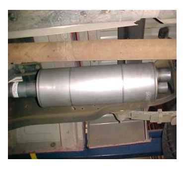
INSTALL MUFFLER AND ATTACH TO HEADPIPE. USING CLAMP #G. DO NOT TIGHTEN. USE JACKSTAND TO SUPPORT MUFFLER.

INSTALL PASSENGER OVERAXLE TAILPIPE #C. INSERT WELDED HANGER INTO RUBBER GROMMET. DO NOT TIGHTEN. ATTACH TAILPIPE TO THE MUFFLER USING CLAMP # F. USE BOLT KIT # I TO ATTACH BOTH OVERAXLE PIPES TOGETHER. THE SPARE TIRE ON SOME VEHICLES MAY NEED TO BE LOOSENED AND PULLED TO THE DRIVERSIDE FOR BETTER CLEARANCE.