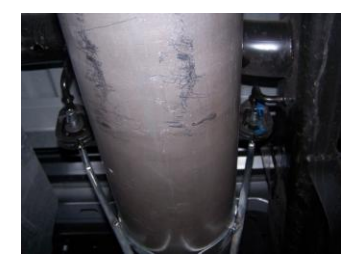
4. Slide band clamp #H onto muffler and attach with bolt kit #J. DO NOT TIGHTEN. Insert hangers into rubber grommets.

7. Attach tailpipes together with bolt kits #I. DO NOT TIGHTEN. Driver side tabs will be on bottom.