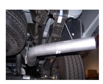
5. Install the passenger side overaxle tailpipe #D into the muffler 1½"-2". Use clamp #F to secure tailpipe to muffler. DO NOT TIGHTEN. Insert welded hanger into rubber grommet.

1. To remove the stock exhaust remove it from in front of the stock muffler. DO NOT REMOVE STOCK HEADPIPE. Disengage the welded hangers using WD-40 from the OEM rubber grommets. Do not damage or remove the rubber grommets as you will re-use them