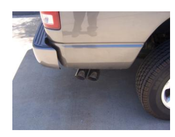
11. Install stainless steel tips #E. Clamp down. When you have everything in place, firmly tighten all bolts and clamps down securely. Use stainless steel cleaner and a Scotch Brite pad weekly to prevent tip from discoloration.