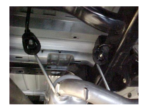
INSTALL MUFFLER ASSEMBLY #A ONTO HEADPIPE 1-1/2" TO 2". SLIDE WELDED HANGERS INTO RUBBER GROMMETS YOU MAY NEED TO ADJUST WELDED HANGERS TO FIT INTO YOUR GROMMETS. USE A JACKSTAND TO SUPPORT YOUR MUFFLER. USE CLAMP #B TO SECURE IT TO YOUR HEADPIPE. DO NOT TIGHTEN.

TO REMOVE STOCK EXHAUST UNCLAMP IT FROM THE CLAMP LOCATED JUST IN FRONT OF YOUR STOCK MUFFLER. YOU MAY NEED TO HEAT IT UP WITH A TORCH TO REMOVE IT. NOW CUT OFF YOUR STOCK TAILPIPE JUST BEHIND THE MUFFLER AND REMOVE.LEAVE ALL RUBBER GROMMETS ON THE HANGER. USE WD-40 TO AID IN REMOVAL OF EXHAUST AND HANGERS.