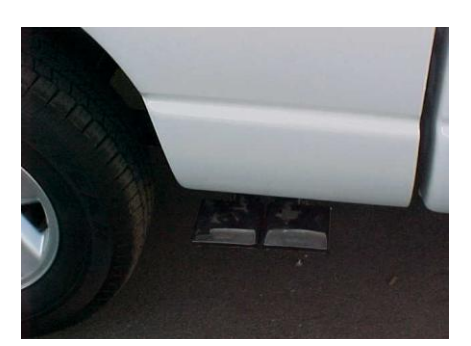
INSTALL YOUR STAINLESS TIPS. TIGHTEN ALL CLAMPS AFTER YOU MAKE SURE YOUR TAILPIPES ARE LEVEL.

AFTER REMOVAL OF STOCK EXHAUST, CUT 2" OFF YOUR STOCK HEADPIPE.