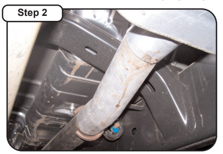
Install head pipe # A onto your existing stock front pipe and attach with clamp #G. Do not tighten . Insert welded hanger into rubber grommet.