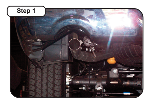
Next, install the exit pipes #E. Use clamp #H to secure to the tailpipes. Adjust all pipes for proper clearance and fitment.