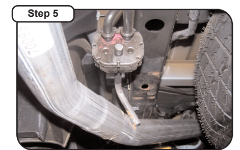
Install drivers side overaxle tailpipe #D into the muffler. Use clamp #H to secure. Do not tighten. Insert welded hangers into rubber grommets.