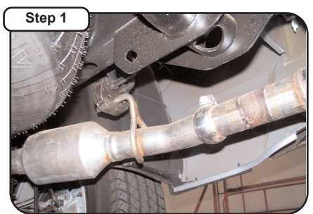
To remove the stock exhaust, remove your factory exit pipes. Next, remove your tailpipes by unbolting them from the back of your stock muffler. Remove your factory muffler from the clamp in front of it. Use WD-40 to aid in removal of factory grommet that will be re-used.

When installing this exhaust system allow use of proper safety precautions. Use jack stands when under the truck, set parking brake, block tires and use safety glasses and gloves. Disconnect the negative battery cable before removal of OEM exhaust. This will allow the computer to reset and recognize the new exhaust. Lay out the exhaust on the floor so it looks like the drawing and compare parts with manual. DO NOT WORK WITH HOT PIPES!