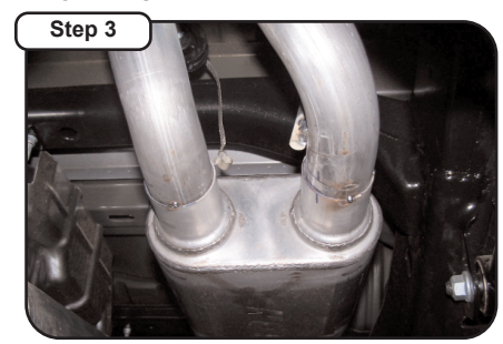
Install muffler #B onto head pipe #A 1 1/2"-2". Use a jack stand to support the muffler. Use clamp #G to secure the muffler to the head pipe. Do not tighten.