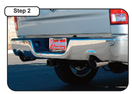
Attach Stainless Steel Tips. When you have everything in place, firmly tighten all bolts and clamps down securely. Use stainless steel cleaner and a Scotch Brite pad weekly to prevent tip from discoloration. Inspect all fasteners after 25-50 miles of operation and re-tighten if necessary.