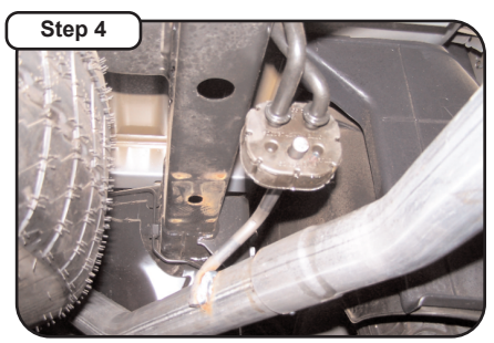
Install the passenger side overaxle tailpipe # C to the muffler 1 1/2"-2". Use clamp #H to secure tailpipe to muffler. Do not tighten. Insert welded hangers into rubber grommets.