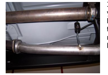
3. Install headpipe #A onto your existing stock front headpipe using stock hardware to secure pipes together. Do not tighten. Insert welded hangers into rubber grommets.

6. Install metal hanger #I into hole located in front of the rear leaf spring stock mount.