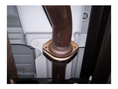
2. To remove your stock exhaust, unbolt the 2-bolt flange located in front of the muffler. Disengage the welded hangers from the rubber grommets. Use WD-40 to aid in this process. Do not remove or damage the rubber grommets as you will reuse them to mount your new system. Now, cut off tailpipe and remove exhaust. Do not throw away stock hardware.

1. Disconnect the negative battery cable before removal of OEM exhaust. This will allow the computer to reset and recognize the new exhaust. Lay out the exhaust on the floor so it looks like the drawing and compare parts with manual.