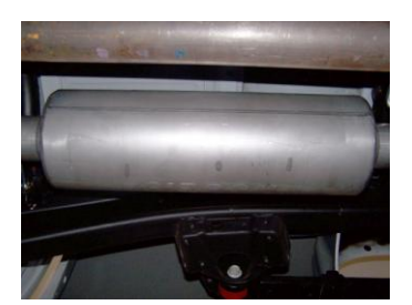
er. Use clamp nuffler to the tighten. king into the