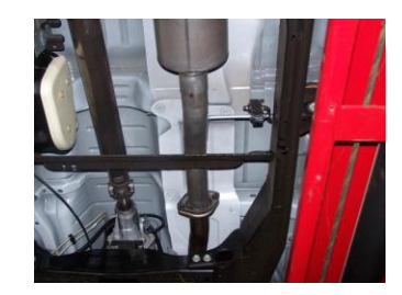
4. Install muffler #B onto head pipe #A 1½"-2". Use a jack stand to support the muffler. Use clamp #E to secure the muffler to the headpipe. Do not tighten.