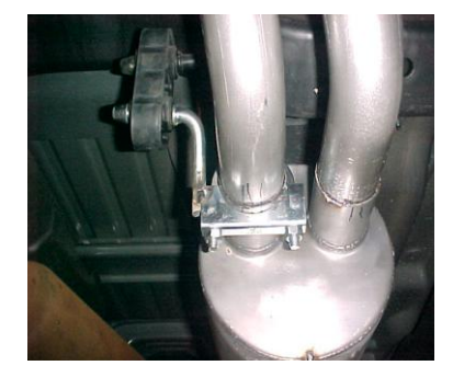
INSTALL REAR MUFFLER HANGER # H ONTO DRIVER SIDE OUTLET OF THE MUFFLER AND INSERT THE WELDED HANGER INTO RUBBER GROMMET.

INSTALL EXIT PIPES # E. USE CLAMPS # G TO SECURE TO THE TAILPIPES. DO NOT TIGHTEN.