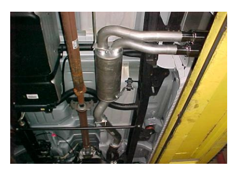
ROTATE THE MUFFLER ASSEMBLY UNTIL THE OUTLETS ARE LEVEL.

INSTALL HEADPIPE #A ONTO STOCK FLANGE, USE STOCK 15MM NUTS TO SECURE IT. DO NOT TIGHTEN, JUST MAKE SNUG.