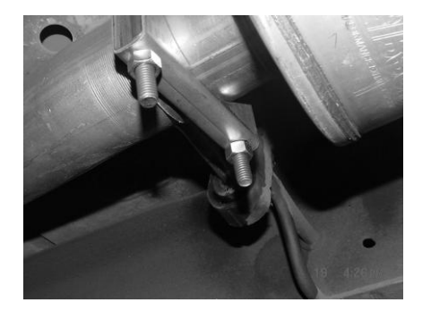
ADJUST MUFFLER ASSEMBLY. NOW TIGHTEN ALL BOLTS AND CLAMPS.