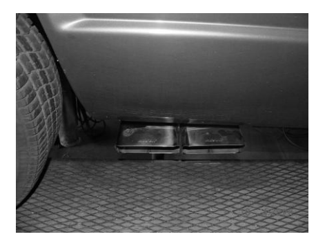
INSTALL STAINLESS TIPS. TO CLEAN TIPS, USE SCOTT BRITE PAD AND ANY STAINLESS AND ALUMINUM CLEANER.

BOLT HEADPIPE #B TO STOCK FLANGE RE-USING STOCK NUTS AND BOLTS. INSERT WELDED HANGER INTO RUBBER GROMMETS.