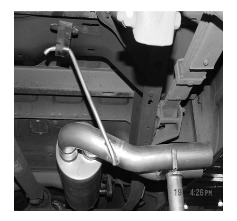
SLIDE MUFFLER ASSEMBLY ONTO HEADPIPE 1 1/2" TO 2". INSERT WELDED HANGER INTO RUBBER GROMMET ON DRIVERSIDE USING CLAMP #C TO SECURE MUFFLER TO HEADPIPE. DO NOT TIGHTEN.

TO REMOVE EXHAUST- UNBOLT THE 2 BOLT FLANGE LOCATED BEHIND THE CATALITIC CONVERTER. SAVE STOCK NUTS AND BOLTS FOR YOU WILL REUSE THEM. NOW CUT OFF YOUR STOCK TAILPIPE JUST BEHIND THE MUFFLER AND REMOVE. LEAVE ALL RUBBER GROMMETS ON THE HANGER. USE WD-40 TO AID IN THE REMOVAL OF THE EXHAUST AND HANGERS.