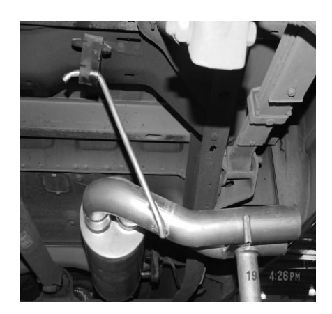
SLIDE MUFFLER ASSEMBLY #B ONTO HEADPIPE 1-1/2" TO 2". INSERT WELDED HANGER INTO RUBBER GROMMET ON DRIVERSIDE USING CLAMP #C TO SECURE MUFFLER TO HEADPIPE. DO NOT TIGHTEN. USE A JACK STAND TO SUPPORT MUFFLER.

TO REMOVE EXHAUST- UNBOLT THE FLANGE LOCATED BEHIND THE CATALITIC CONVERTER. SAVE STOCK NUTS AND BOLTS FOR YOU WILL REUSE THEM. NOW CUT OFF YOUR STOCK TAILPIPE JUST BEHIND THE MUFFLER AND REMOVE. LEAVE ALL RUBBER GROMMETS ON THE HANGER. USE WD-40 TO AID IN THE REMOVAL OF THE EXHAUST AND HANGERS.