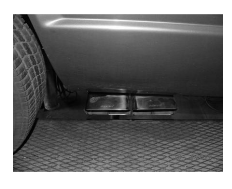
INSTALL STAINLESS TIPS. TO CLEAN TIPS, USE SCOTCH BRITE PAD AND ANY STAINLESS OR ALUMINUM CLEANER. NOW TIGHTEN ALL BOLTS AND CLAMPS

BOLT HEADPIPE #A TO STOCK FLANGE USING GASKET # F AND RE-USING STOCK NUTS AND BOLTS. INSERT WELDED HANGER INTO RUBBER GROMMETS.